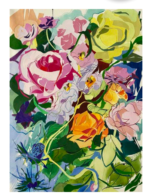
December Roses California