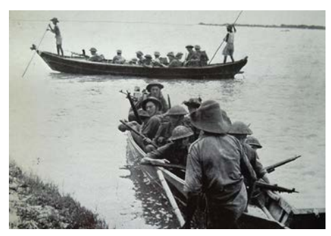
Patrolling on the River Sittang