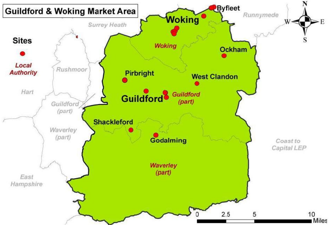
Figure 3: Guildford and Woking Market Area as Defined in Enterprise M3 Commercial Property Market Study.

Source: Enterprise M3 LEP Commercial Property Market Study 2013 (Appendix 7)