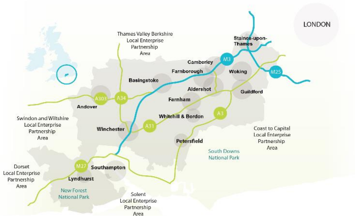
Figure 1: Geographic area covered by the Enterprise M3 LEP.

close proximity to London, the key international gateways of Heathrow and Gatwick airports, and sea routes from Southampton.