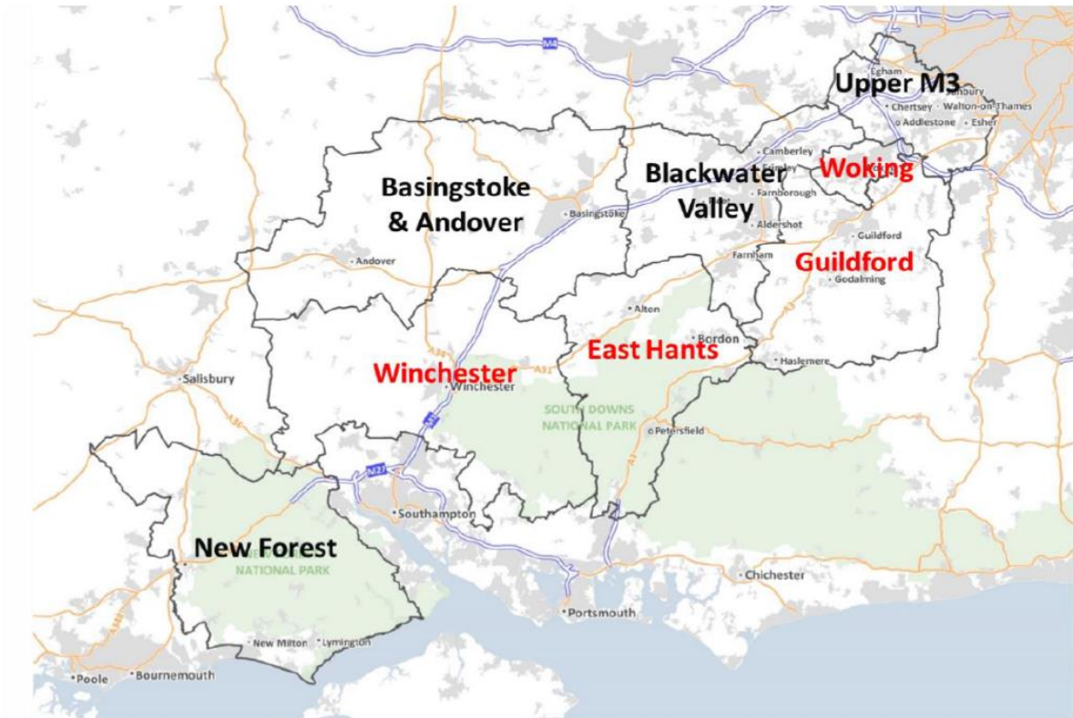
Figure 4: Revised Commercial Property Market Areas.