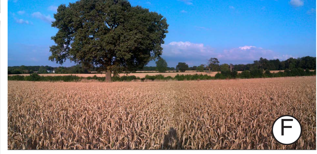
Photo F - View from public footpath looking east towards ancient woodland and AONB on the right. The hedge in the foreground indicates the proposed new urban boundary.