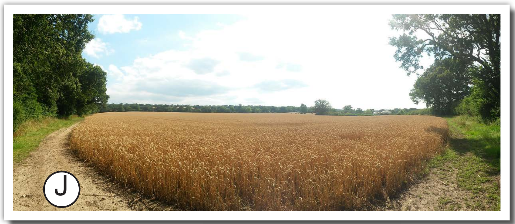
Appendix 9 - page 6

Photo J - View from the edge of the ancient woodland showing the Hog's Back ridge in the distance.