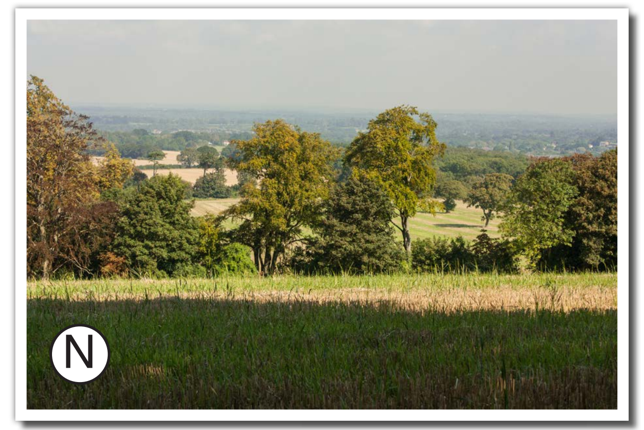
Photo N - View looking north from AONB (from Hog's Back ridge) across Blackwell Farm

Photo M - View from footpath towards AONB. GBC has responded to consultation by excluding AONB and this field from its Local Plan, so the UniS is poposing to build sports pitches in this field and the access road along its edge.