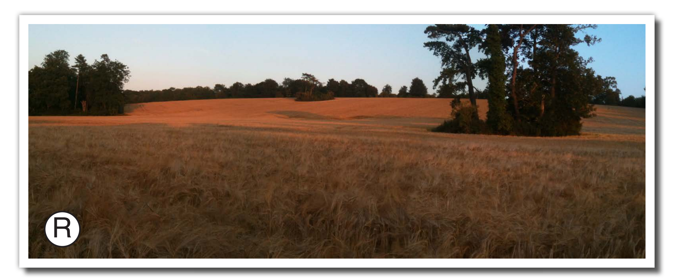
Photo R - Views from footpath to the south and AONB. The proposed line of the access along the slopes of the Hog's Back (parallel to Down Place) will turn and pass along the left side of this photograph.