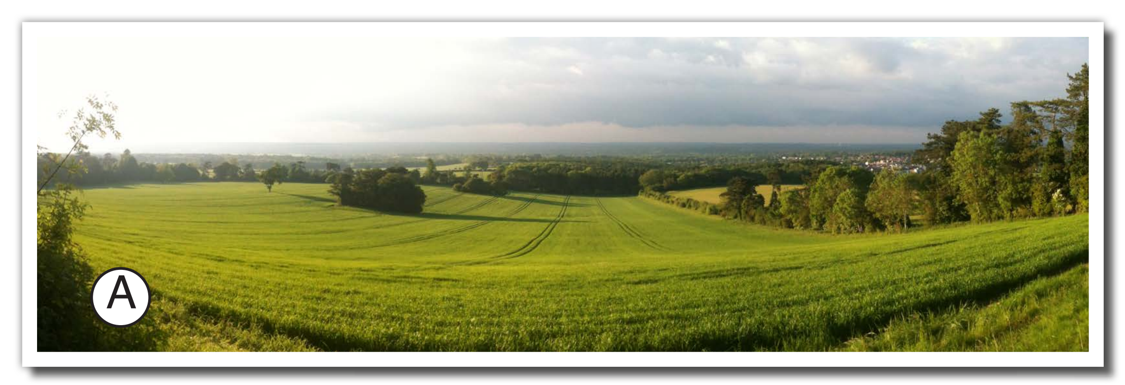
Photo A - View from Down Place drive from AONB (looking North). The UniS is planning to put a road along the eastern edge of this field and build sports pitches on the lower slopes.