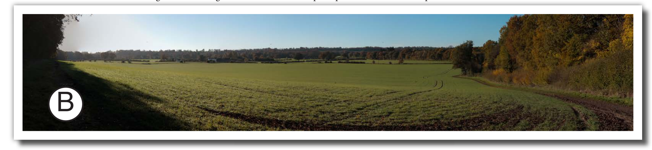
Photo B - View from public bridleway pointing south towards the ridge and land designated AONB.