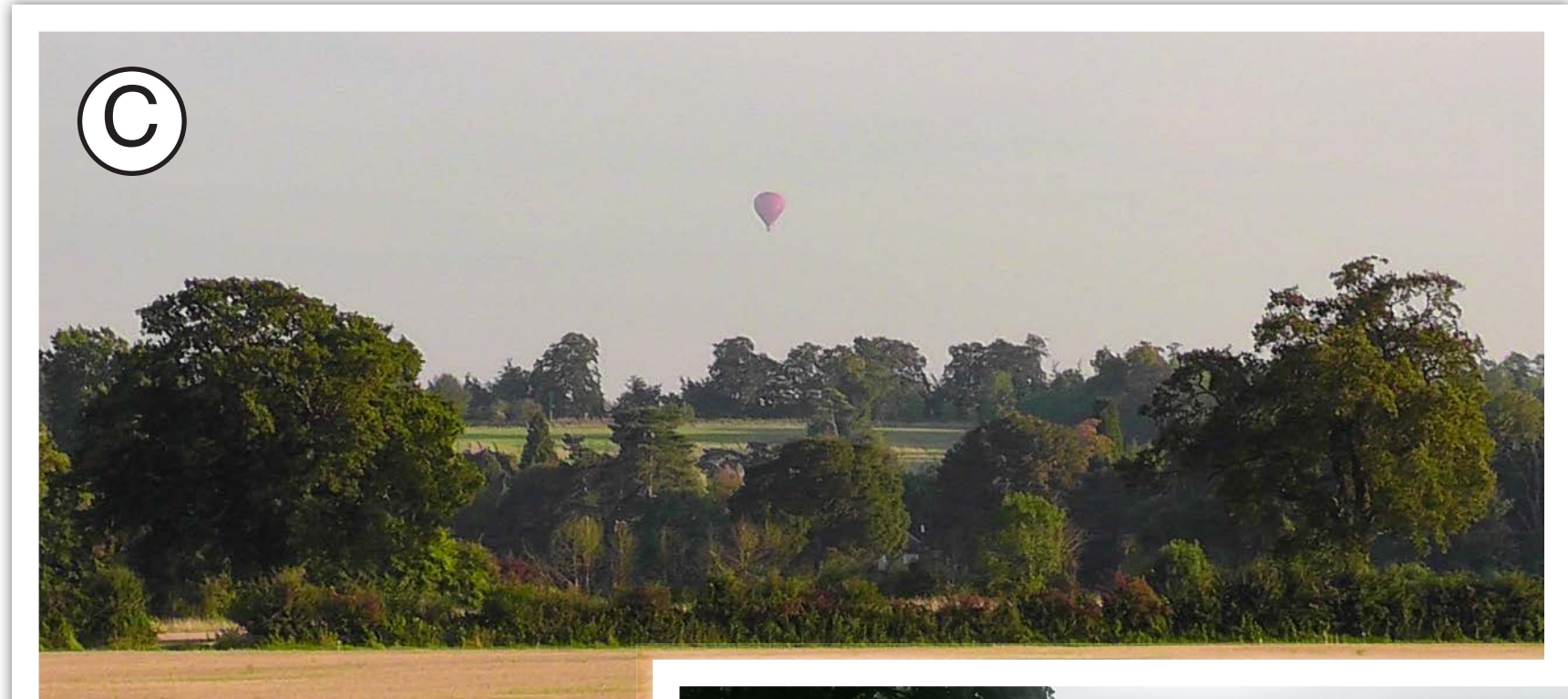
Photo C - View from public bridleway pointing south to land designated AONB.