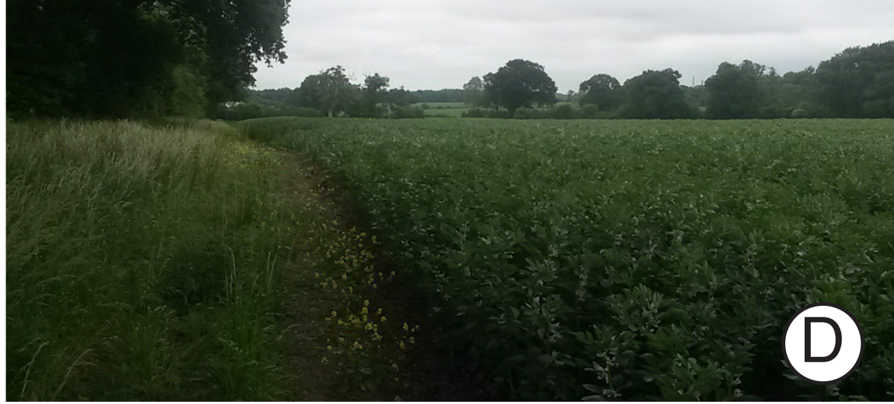
Photo D - View from public bridleway looking east towards ancient woodland and AONB on the right of the view (masts on the Mount are visible).