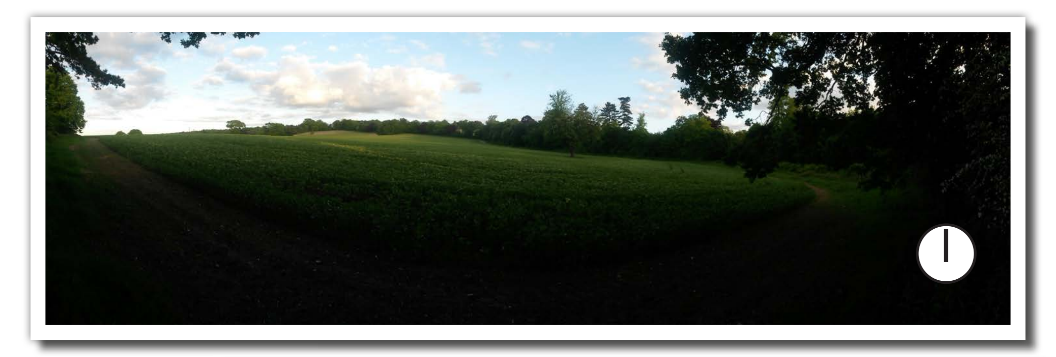
Photo I - View towards Hog's Back ridge/AONB. GBC has responded to consultation by excluding this field from its Local Plan, so the UniS is proposing sports pitches in this field and the access road along its edge.

Photo J - View from the edge of the ancient woodland showing the Hog's Back ridge in the distance.