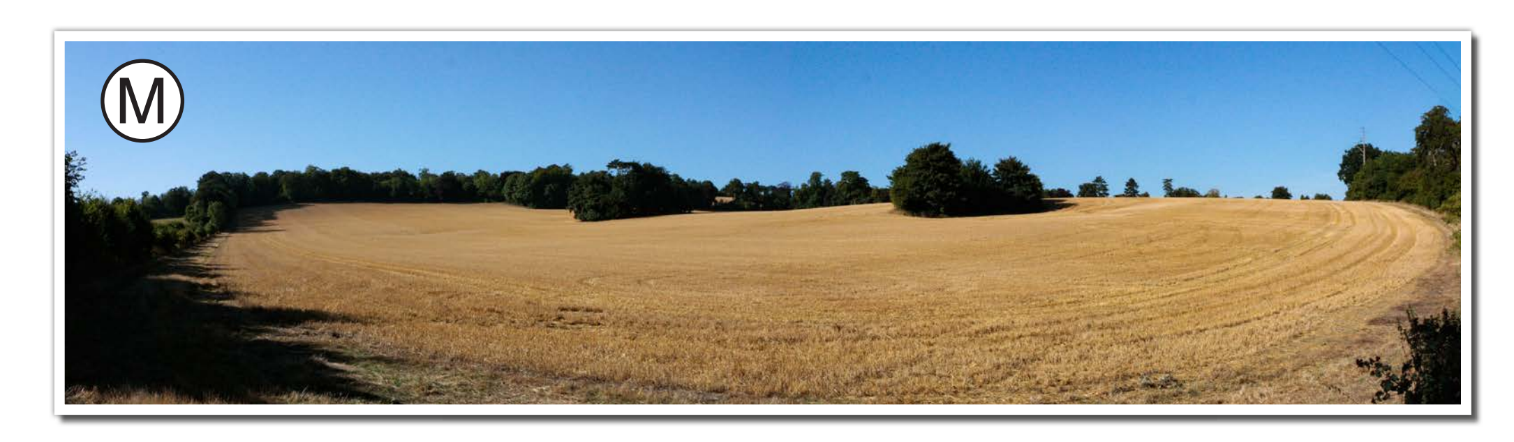
Photo M - View from footpath towards AONB. GBC has responded to consultation by excluding AONB and this field from its Local Plan, so the UniS is poposing to build sports pitches in this field and the access road along its edge.

Photo N - View looking north from AONB (from Hog's Back ridge) across Blackwell Farm