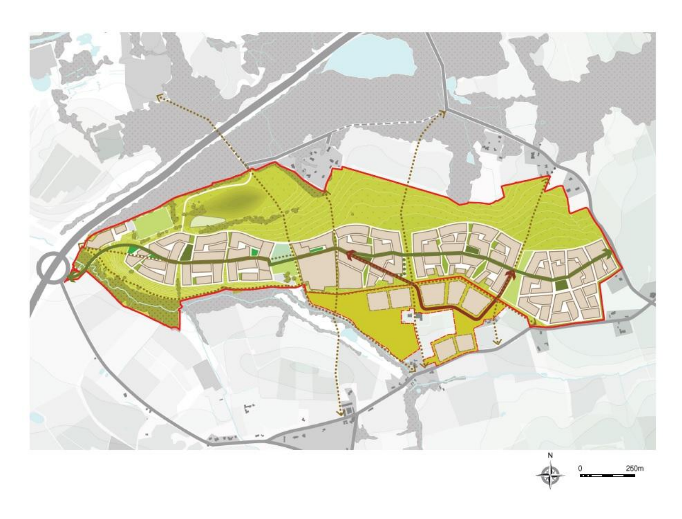
Figure 2 - Wisley Masterplan Framework and Future Development of Further Allocated Land