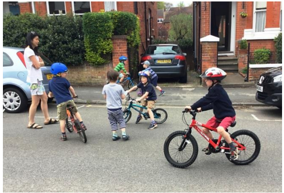
The interaction and communication between children in their playful street