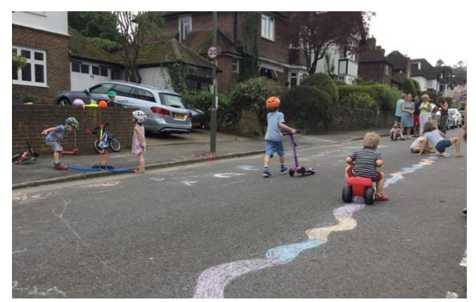
"We're not going to stop until we run out of chalk" exclaimed one young person

"We would just like to congratulate you on your efforts to get the children out to play. We no longer have small children and even our grandchildren are quite grown up now so would love to hear the sound of today's children playing outside in the fresh air and often say how sad it is that it doesn't seem to happen these days. We look forward to hearing a knock at the door from someone asking if they can please have their ball back."