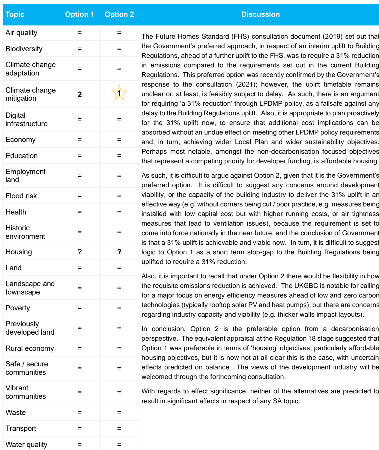
Table 6.1: Decarbonisation – alternatives appraisal