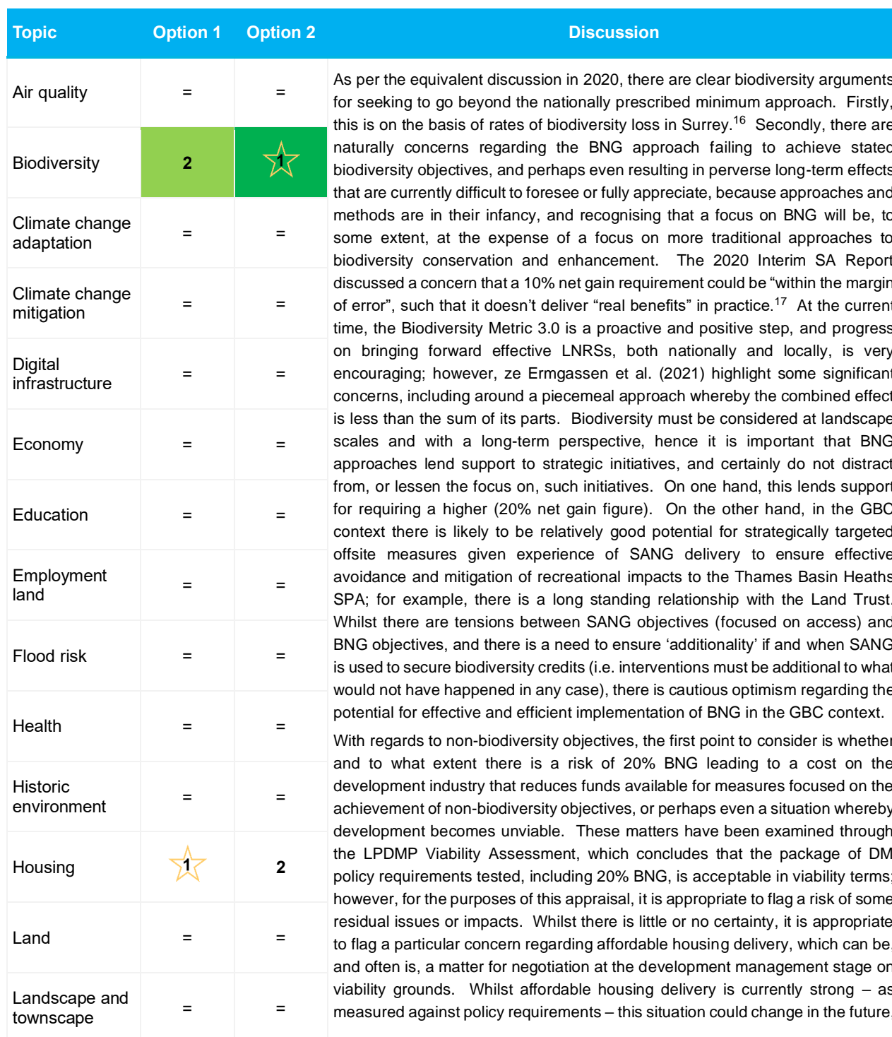
Table 5.1: Biodiversity – alternatives appraisal