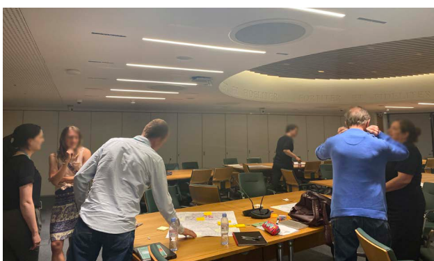
Figure 38. Phase 1 external stakeholder meeting