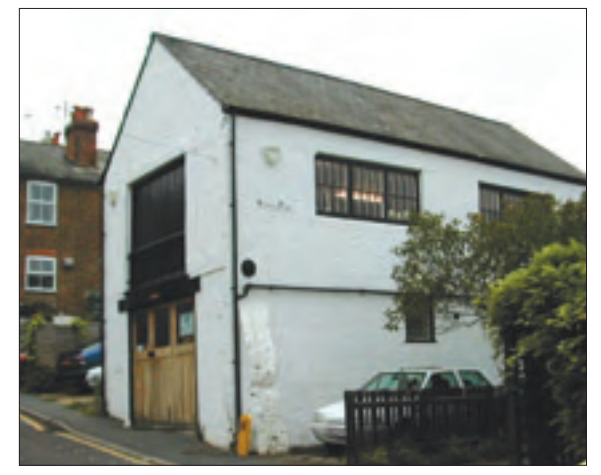
Addison Glassworks, Alexandra Place

Currently, as a result of facilities as well as workplaces being out of the immediate area, the Conservation Area suffers from the effects of parked cars on every street and through traffic, especially on Addison Road. Cars are generally detrimental to the character and appearance of the Conservation Area.