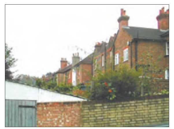
Backs of houses in Addision Road.