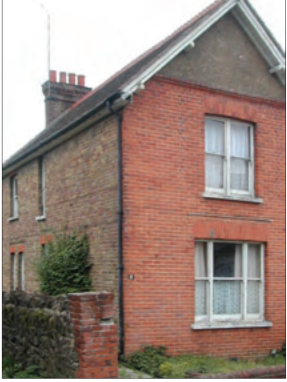
3 Chesham Road

Another part of Charlotteville in its original form is number 3 Chesham Road. This is a modest buff and red brick house that, because of its original condition, makes a significant contribution to the character of the street and to the Conservation Area as a whole. It is probably the only Charlotteville house that survives in its original condition. Though it might be considered to be in need of some careful maintenance at the time of writing, it illustrates how Charlotteville houses had natural clay tile / slate roofs, timber vertical sliding sash windows and timber doors. It demonstrates original masonry elevations undamaged by incorrect re-pointing. It is fair to say that it is now generally accepted that houses in their original condition or that are intelligently updated retain a higher market value than those that have been insensitively modernised.