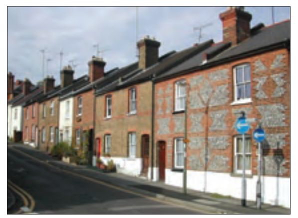
23-25 Cooper Road: decorative flintwork

Looking down the hill along Cooper Road just below the junction with Warren Road, a wide view of Charlotteville can be enjoyed. This view itself gives an overview of the whole Conservation Area.