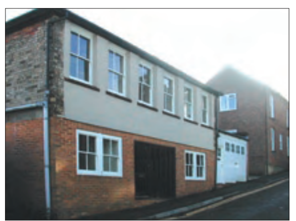
Eldonway House , Alexandra Place