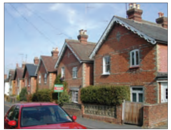
Decorative brickwork and some original door and window openings survive

The distinctive patterned brickwork found on the houses at 23-25 Cooper Road terminates the view west along the street. The trees and fields of Pewley Down seen across the school playground terminate the view east. Views along the street frontage are given additional character by the stepped arrangement of numbers 15-37.