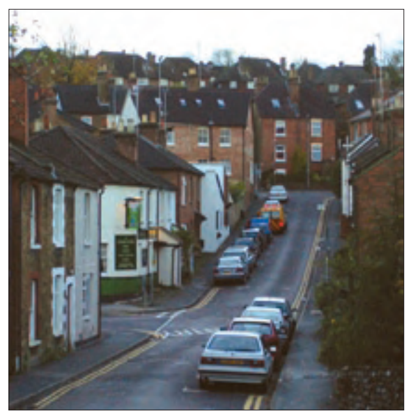
Cooper Road sloping topography

An outstanding and attractive example of this is demonstrated at numbers 128-140 Addison Road where the houses are entered via 'sentry box' porches at upper ground floor level, over small bridges which also provide canopies to the lower ground floor entrances.