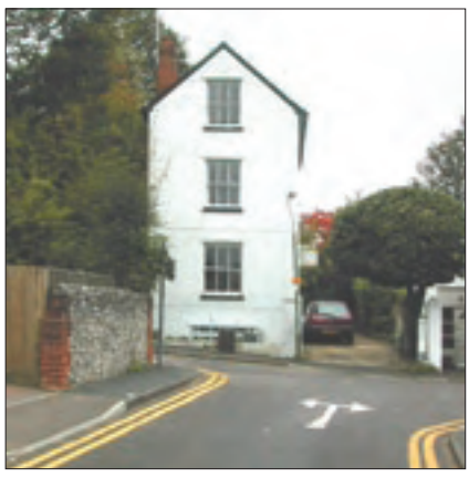
1-3 The Grove terminates the vista