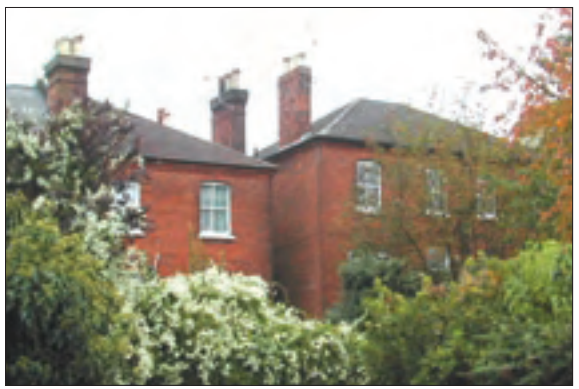
Backs of houses in Baille Road.