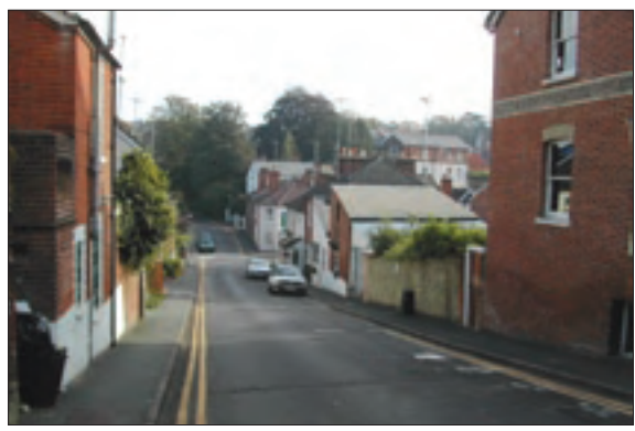
Cooper Road looking towards Warren Road

The changing levels of the similarly scaled elements on neighbouring houses such as eaves heights, chimneys, windows and doors give these streets their individual and valued characteristics.