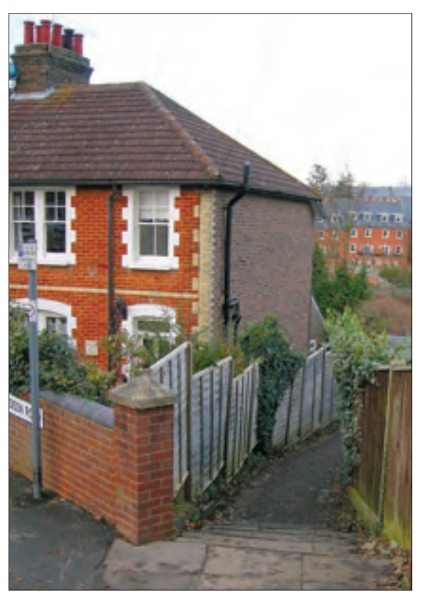
Footpath from Addison Road to Cline Road

There are a small number of public footpaths within Charlotteville linking it into the surrounding area. It is believed that a number of footpaths to and from what was the hospital have been lost in the process of the redevelopment of the St Luke's site. This will have isolated Charlotteville from its surroundings and will have reduced the permeability of the area to the pedestrian. New footpaths will be actively encouraged.