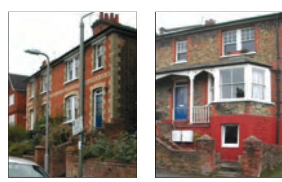
House designs accomodate the slope of the valley.

The location of this Conservation Area adjacent to Pewley Down and the Surrey Hills Area of Outstanding Natural Beauty is also an essential part of its character, giving many varied glimpses of the adjacent green hills.