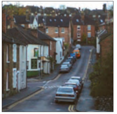
Cooper Road looking towards Addison Road