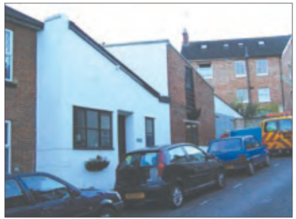
Commercial uses: Cooper Road