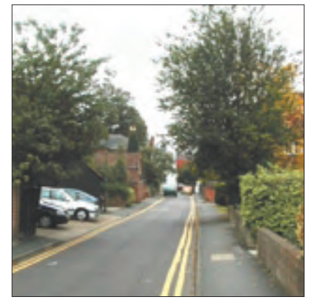
Chesham Road looking towards Warren Road