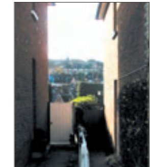
Unobstructed glimpses of surrounding area through gaps between buildings