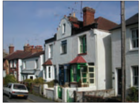
Addison Road: early Charlotteville cottages.

The raised pavement and the taller buildings, many with upper ground floor level entrances, on the south side of the road is a strong characteristic of the area, as is the presence of basements at lower ground floor level capitalising on the opportunities offered by a sloping site. Sadly, many of the basements have been converted to garages resulting in the loss of original garden walls and enclosure of the street.