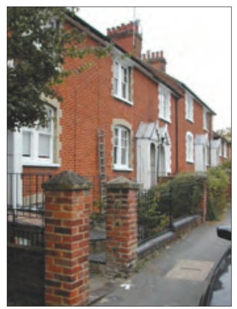
Ground floor and lower ground floor entrances on the North side of Addison Road.