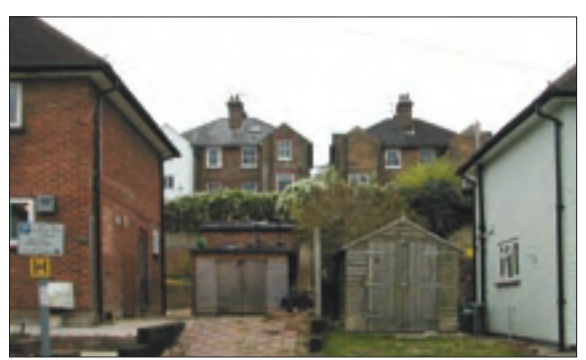
Backs of houses in Addision Road viewed from Cline Road.