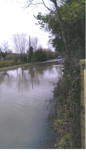
Pound Hill, WSV