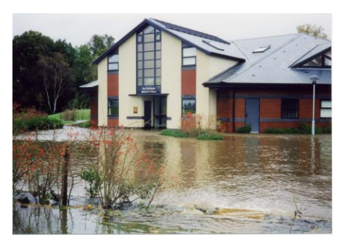
Fairlands Doctors' Surgery

The National Planning Policy Framework (NPPF) (paragraphs 99-104) and National Planning Policy Guidance place a strong emphasis on planning for climate change; appropriate development should only be considered where flood risk is not increased elsewhere, and only in areas at risk of flooding where informed by a site-specific flood risk assessment.