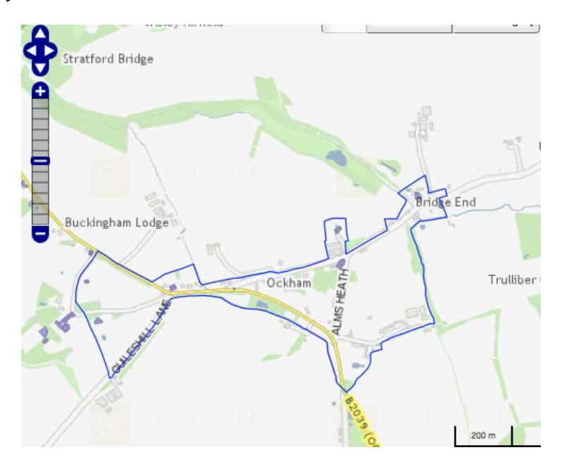
Figure 11: Extract showing Ockham Conservation Area

12 Ockham Village has been designated as a Conservation Area by Guildford Borough Council. The proposal site is adjacent but not within the conservation area. The boundary of the conservation area is identified below: