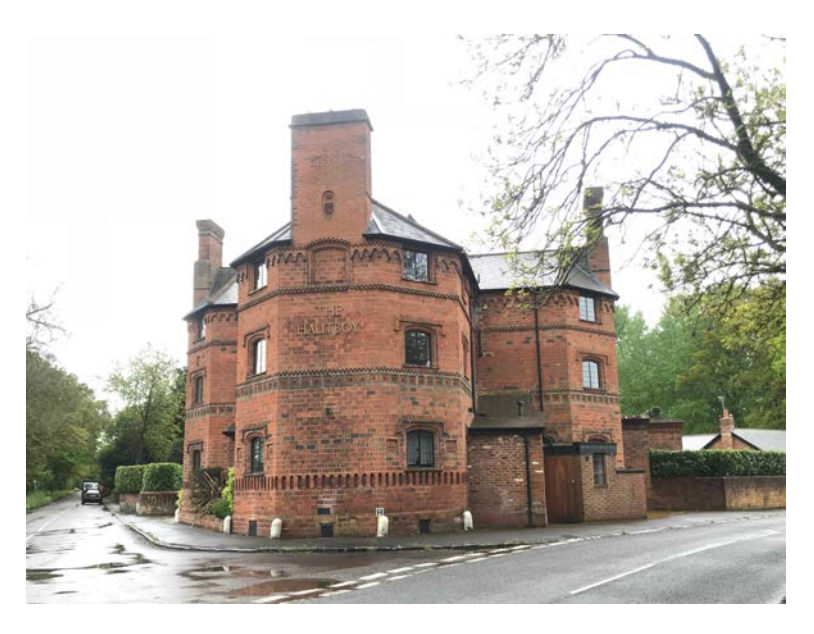
Figure 18: The former Hautboy Inn, Ockham Lane and Alms Heath

The former Hautboy Inn, built in 1864 as a hotel as part of the Estate development by the Earl of Lovelace was clearly designed to be an 'eye-catcher'. It is located on the south western corner of the junction with Ockham Lane and Alms Heath with decorative elevations designed to be appreciated from all road facing sides. Decoration includes terracotta plaque bands with oval panels and dentilled billets over each floor and machicolations to the eaves. The Lovelace Coat of Arms is on each stack. The building contained a Baronial Hall in the south wing with a minstrels gallery inspired by a building Lovelace had seen on his trip to the Continent<sup>4</sup>.