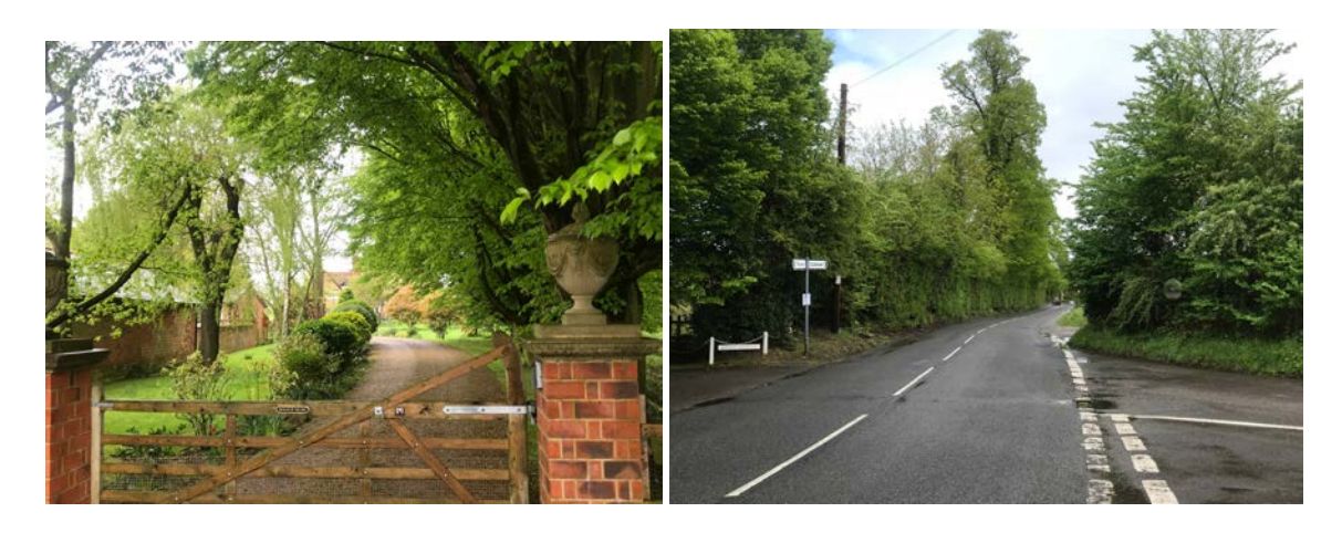
Figure 16 & 17: Appstree Farm, Ockham Lane and the view east along Ockham Lane.

The former Hautboy Inn, built in 1864 as a hotel as part of the Estate development by the Earl of Lovelace was clearly designed to be an 'eye-catcher'. It is located on the south western corner of the junction with Ockham Lane and Alms Heath with decorative elevations designed to be appreciated from all road facing sides. Decoration includes terracotta plaque bands with oval panels and dentilled billets over each floor and machicolations to the eaves. The Lovelace Coat of Arms is on each stack. The building contained a Baronial Hall in the south wing with a minstrels gallery inspired by a building Lovelace had seen on his trip to the Continent<sup>4</sup>.