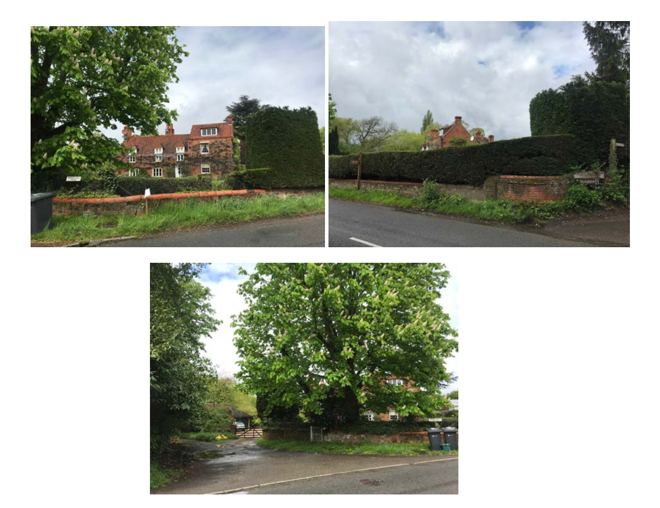
Figure 13, 14 & 15 : Grade II listed Bridge End House, Ockham Lane from centre, east & west.

22 To the west, still within the conservation area, Appstree Farmhouse is listed Grade II. Now divided, this farmhouse dates to the 16<sup>th</sup> century with 20<sup>th</sup> century extensions to the front and rear<sup>3</sup>. It is set back from Ockham Lane down a drive surrounded by mature trees. This gives the listed building a more 'separate' and rural feel than those closer to the road boundary. Its listing reflects the value of the farm as part of the historic rural community and which is manifested in the different layers of architecture that still remain within the building.