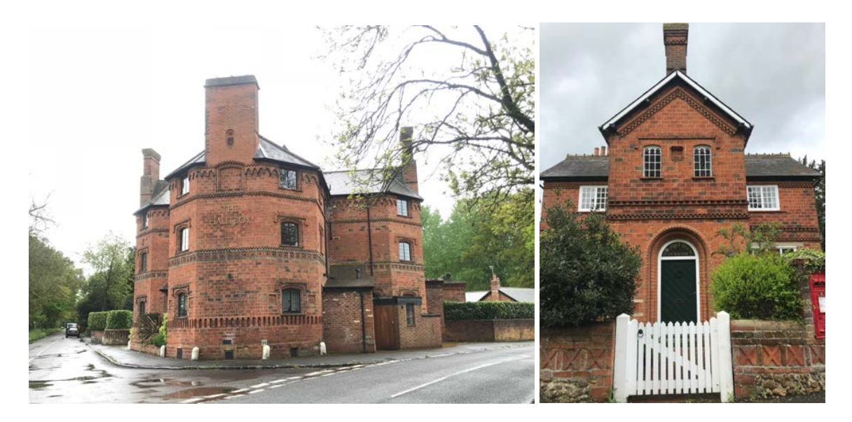
Figure 1&2: The Hautboy Inn and The Old Post House