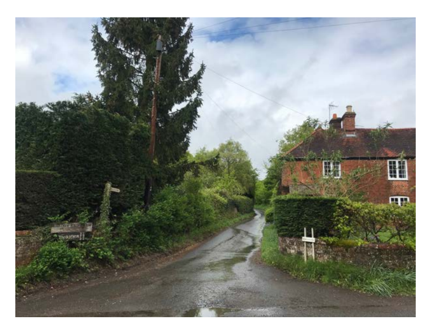
Figure 12: View looking north up Hatch Lane towards Bridge End Farm.

20 The wider setting of the conservation area is largely agricultural although the focus of the area appears to be mainly inward looking and focussed on the historic settlement itself.