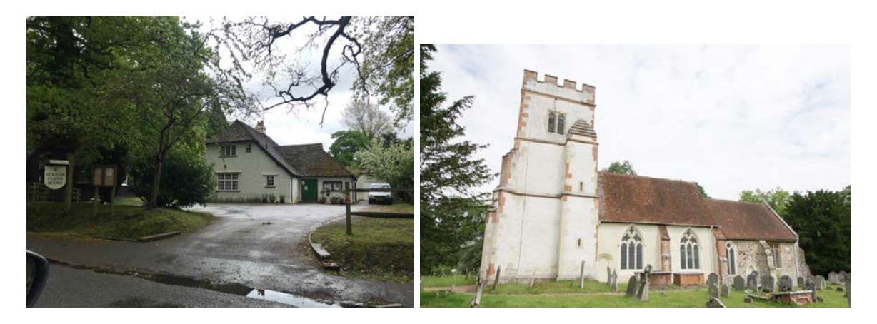
Figure 3&4: Ockham Parish Rooms and All Saints Church