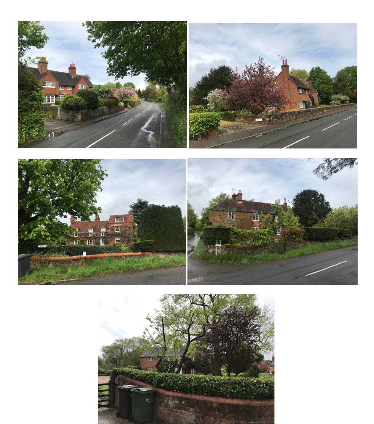
Figure 5-9: Properties located at Bridge End, along Ockham Lane